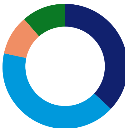
Breakdown by risk category as at December 31, 2020 (as a % of portfolio)

At the end of December 2020, an allocation to the Sustainable Mobility and Infrastructure theme was established by buying sterling-denominated bonds of East Japan Railway, Prologis, SNCF Réseau and Toyota. Under the Renewable Resources theme bonds issued by United Utilities Water and a qualified use-of-proceeds green bond issued by the European Investment Bank were added. For the Social Inclusion and Empowerment theme, the sub-fund bought bonds issued by BNG Bank, EIB, Deutsche Telekom, Kreditanstalt für Wiederaufbau, Nederlandse Waterschapsbank and Vodafone. For liquidity and duration risk management purposes, the sub-fund maintained an allocation to short-maturity UK Gilts and cash in the portfolio.