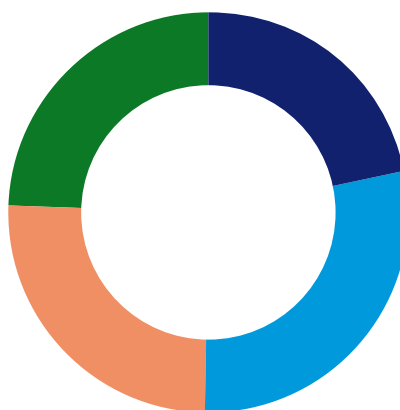
Breakdown by risk category as at December 31, 2020 (as a % of portfolio)

The defensive allocation resulting from an underweight position in corporates and an overweight position in government-related bonds compared to the benchmark had a negative impact on the relative performance of the sub-fund. The selection effect and curve carry contribution were neutral on a portfolio level. The curve change contribution was positive.